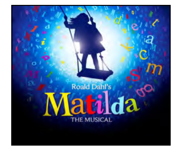
November 1, 2 & 3, 2019