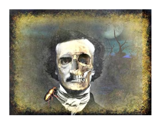
Poe: The Dark Side

Set Construction for the first production of our 85th season, Noises Off , will begin on Saturday, September 11, 2021 at 10 AM. Set work will continue every Saturday until the set is completed or until we move to WiHi (whichever comes first). Many hands make lighter work. No special skills are necessary to work on the set. There will be something for everyone to do regardless of technical ability. Spend an hour or two or spend the day! All help is appreciated.