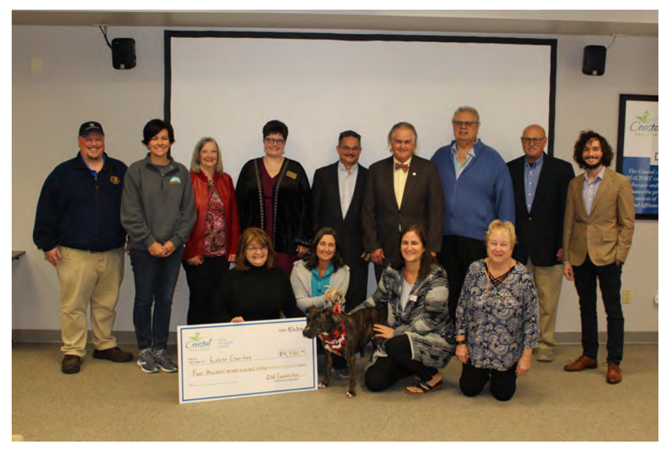
Representatives of Coastal Association of Realtors and those groups which received CAR grants at the presentation on November 16, 2021